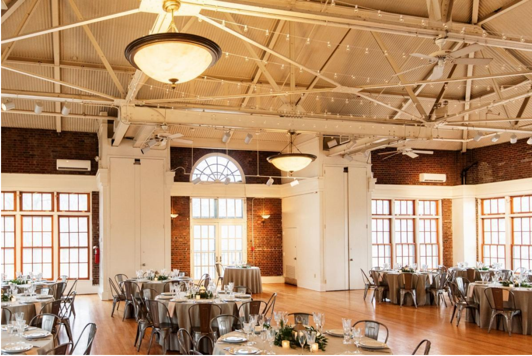
Picnic House set for a wedding