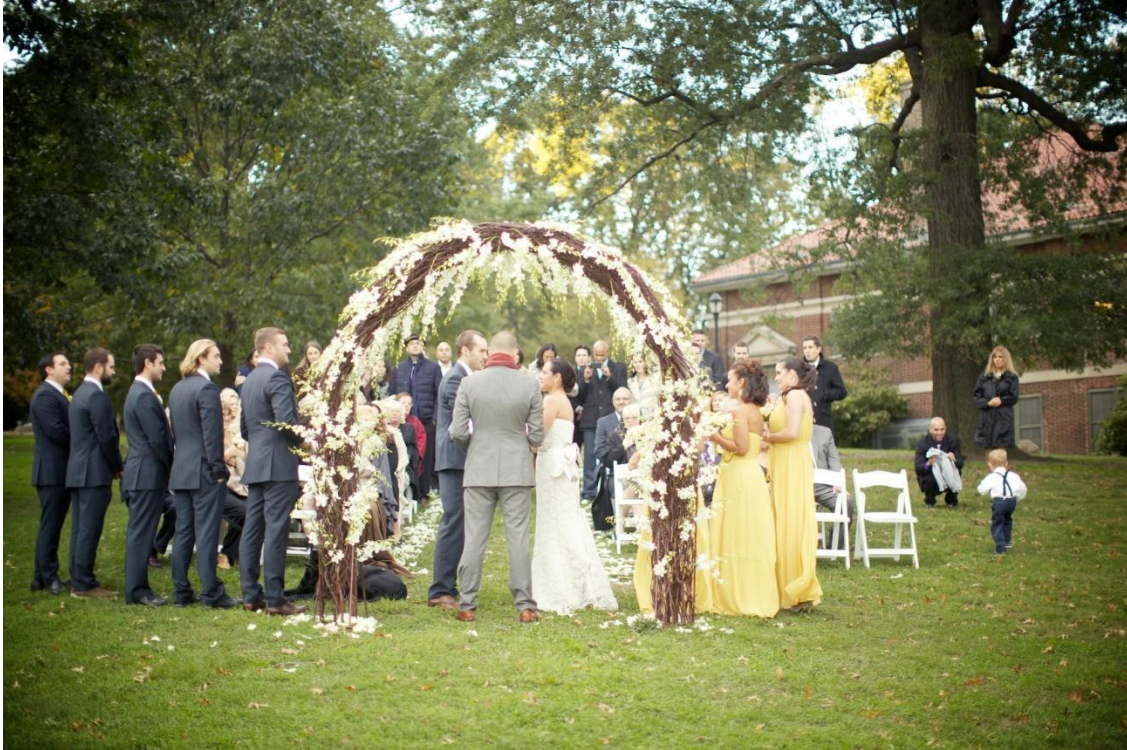
Ceremony on the lawn outside of the Picnic House