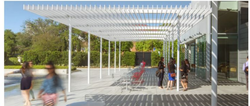
The Cherie Flores Garden Pavilion, BCJ