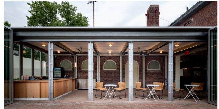
McCarren Park House, Ktisma Studio