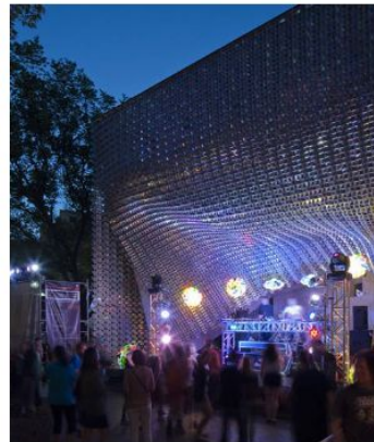
Old Market Square Stage, 5468796 Architecture