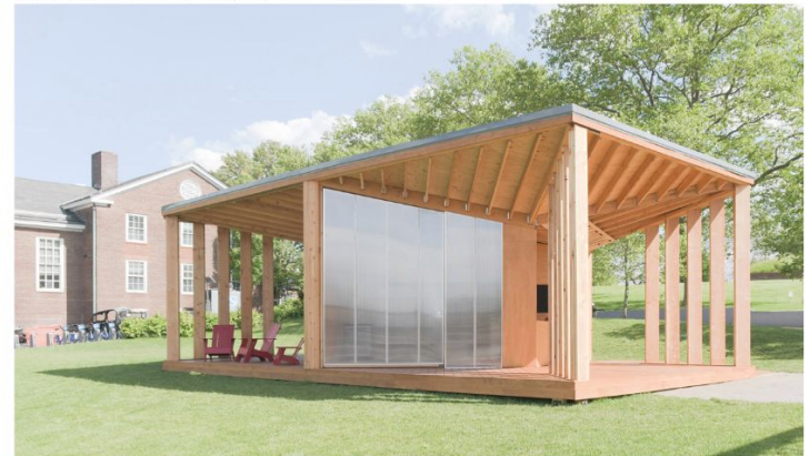
Governors Island Welcome Center, Office III