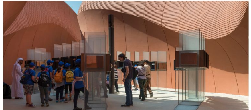
UAE Pavilion Milan Expo 2015, Foster & Partners