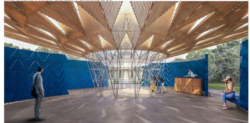
Serpentine Pavilion, Francis Kéré