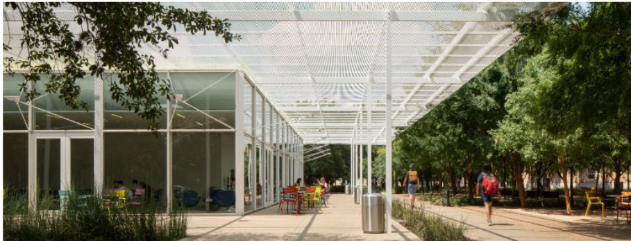
Brochstein Pavilion, Thomas Phifer and Partners

The Welcome Center could include an extension that provides covered outdoor space for gatherings, performances and/or exhibit panels.