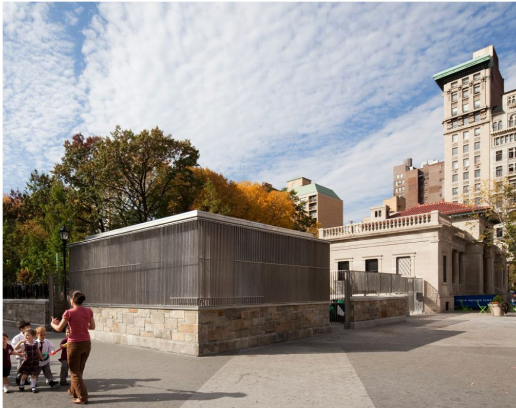
Union Square Restroom, Architecture Research Office

The Welcome Center could include a modern extension to the historic building to house restroom facilities or other needs.