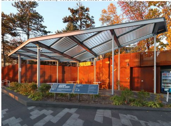
Gov. Mario Cuomo (Tappan Zee) Bridge Welcome Center, Wilkinson Eyre Architects