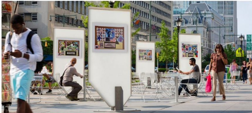
DOT Art Display, Architecture Research Office

The Welcome Center could include panels or other elements to display art and general visitor information.